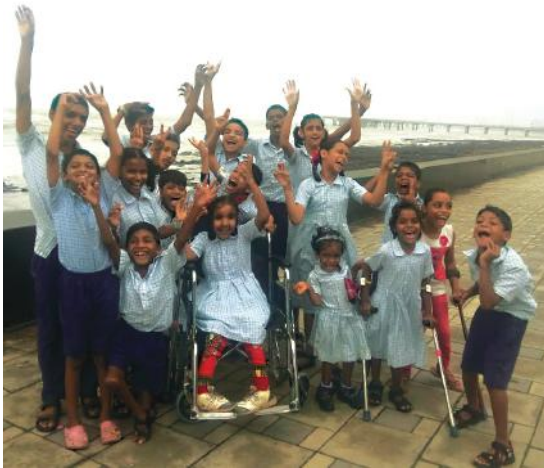
A trip to Worli Sea Face