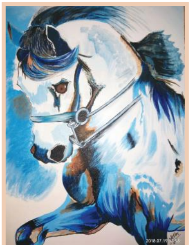
Nitin Bhise – Royal Turn Size 18 x 24 Rs. 5,500/