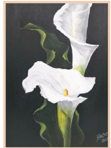
Haseeb Chaudhary - Peace Size 16 x 20 Rs. 4,500/