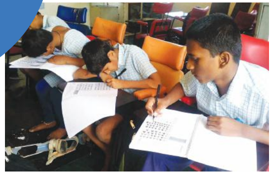
Calligraphy session in progress