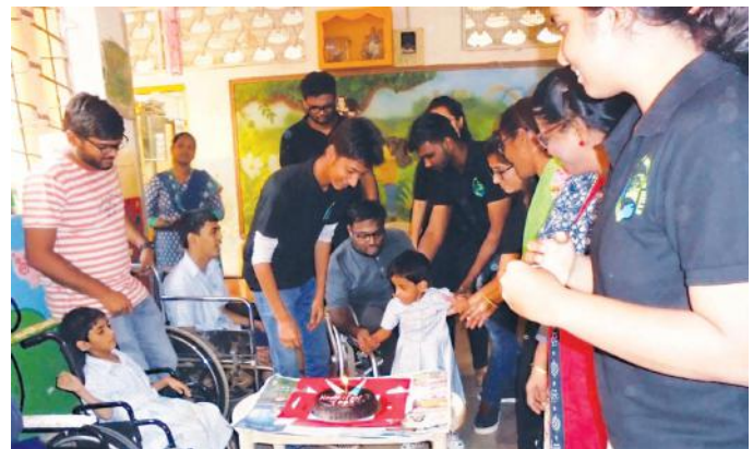
Birthday Party sponsored by 'Spread The Smile'